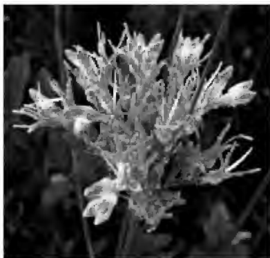
Figure 2. Redroot ( Lachnanthes caroliniana ), east of Sandy Pond.